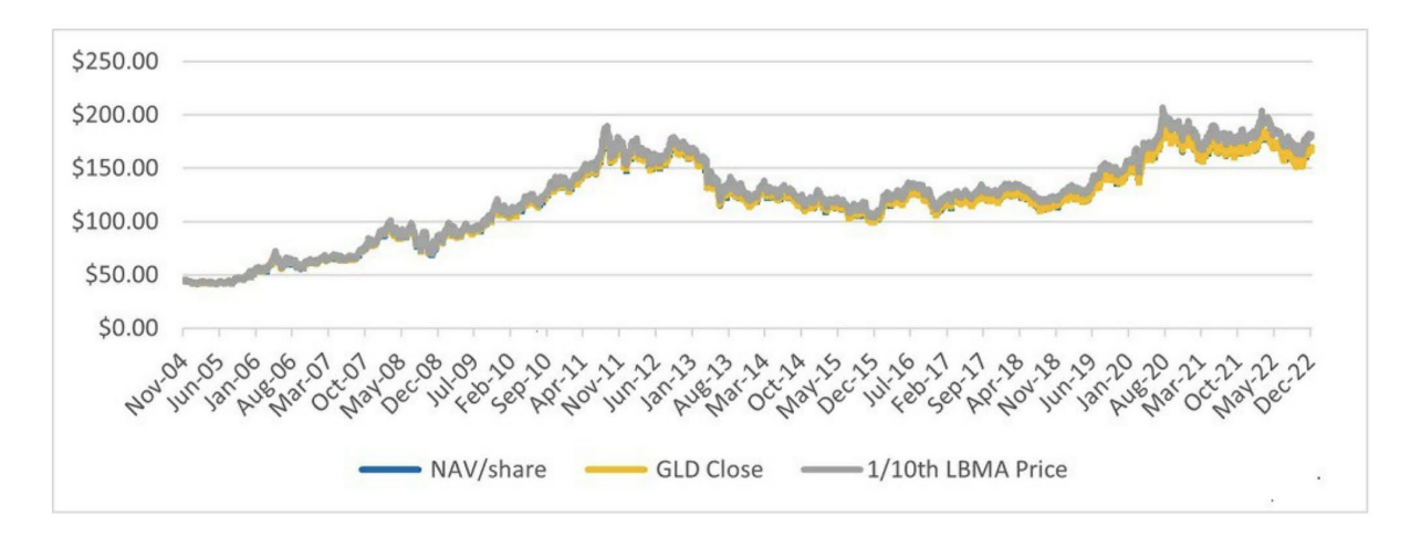
Share price & NAV v. gold price - 18 November 2004 to 31 December 2022

The following chart provides historical background on the price of gold. The chart illustrates movements in the NAV per Share compared to movements in the price of gold in U.S. dollars per ounce over the period from the day the Shares began trading on the NYSE on 18 November 2004 to 31 December 2022, and is based on the previous gold pricing benchmark, the London PM Fix (as defined below), before it was replaced by the 3:00 p.m. London time LBMA Gold Price (the "LBMA Gold Price PM") on 20 March 2015. London Gold Market Fixing Limited had been publishing a fix during London trading hours, which provided reference gold prices for the day's trading (the "London Fix"). Market participants usually referred to either the morning (AM) or afternoon (PM) London Fix (the "London PM Fix") when looking for a basis for valuations.