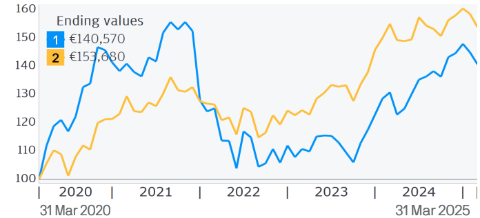
Calendar Year Performance (%)